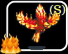
Volcaniana: Planet Anubia