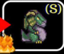
Gorganon: Planet Narui