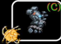
Roller Drone: Deep Space