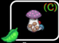
Fungoos: Planet Ganakun