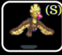
Cloud Stalker: Deep Space