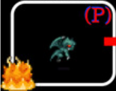
Gorgur: Planet Narui