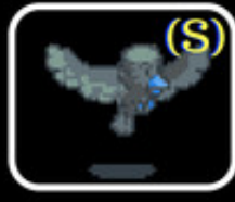
Nightwing: Deep Space