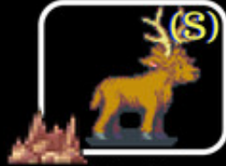
Seria Elk: Tremulor