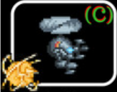
Copter Drone: Deep Space