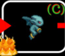
Gorgun: Planet Narui